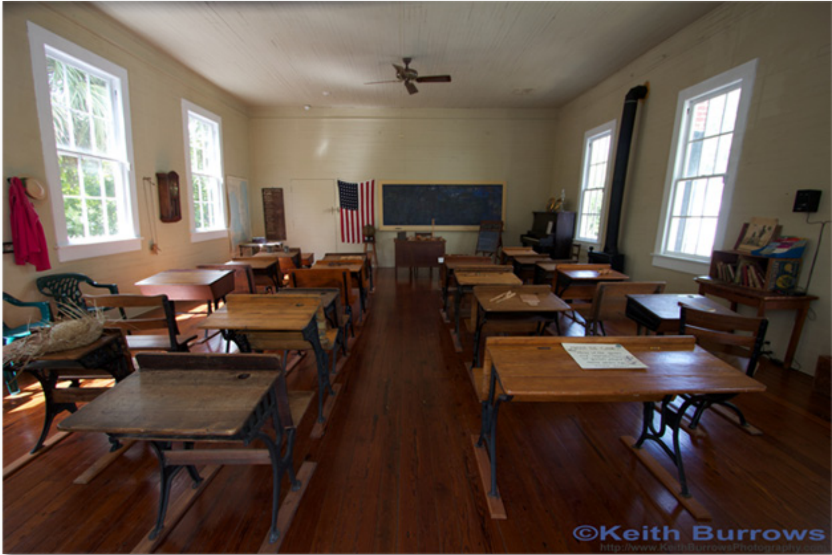
Before Topaz Adjust