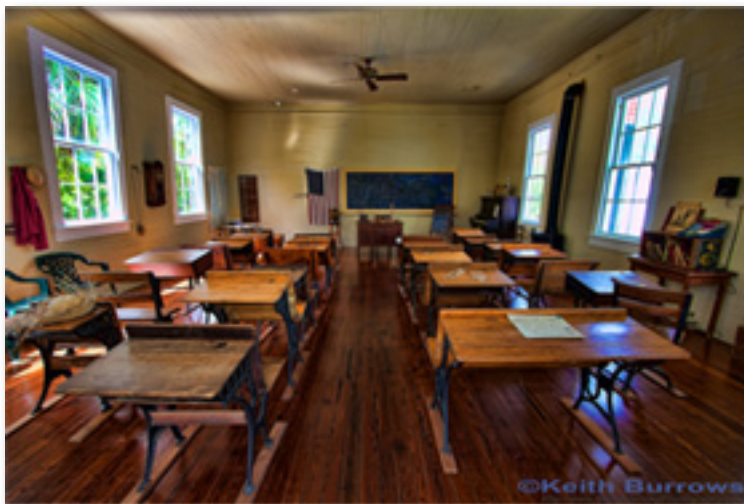
After Topaz Adjust

This workflow is going to allow us to create a surreal, HDR-like effect. For this example we will be working only the Spificy preset, a few of the sliders and Vibrance control (found in Photoshop, Lightroom and Aperture). So let's get started.