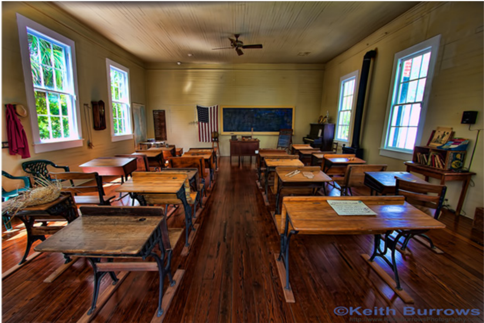
After Topaz Adjust