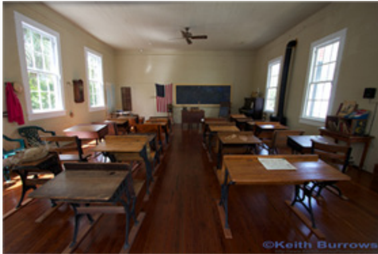
Before Topaz Adjust

In this project, we will walk you through a very quick and easy workflow that was submitted by one of our Topaz users.